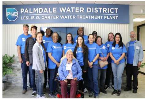
2019 Water Ambassadors