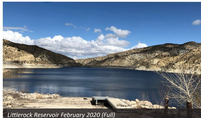
Littlerock Reservoir February 2020 (Full)