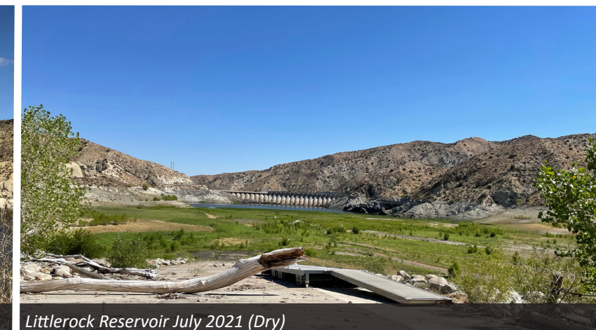
Littlerock Reservoir July 2021 (Dry)