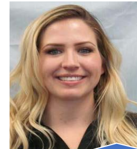
Safety & Training Tech