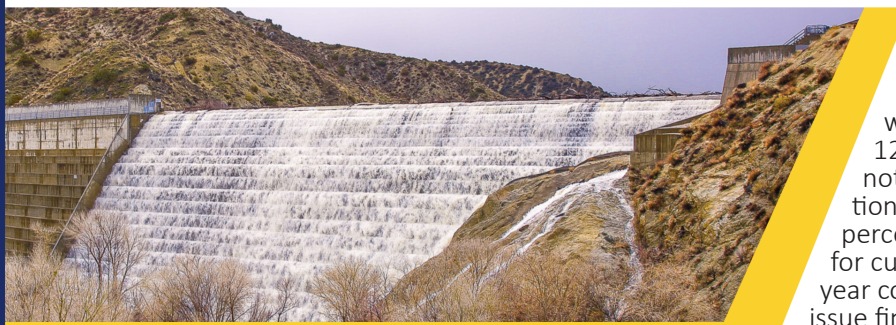
Littlerock Dam overflowing after severe rainstorms in January.